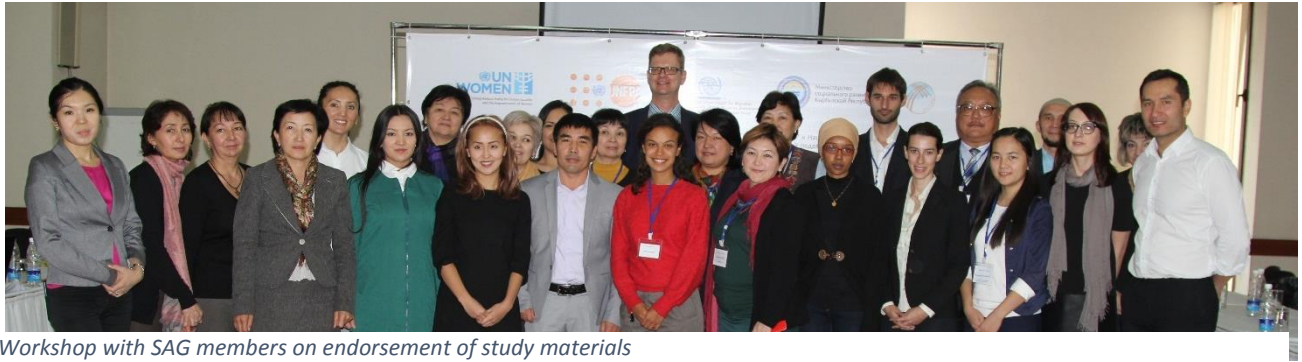
Workshop with SAG members on endorsement of study materials