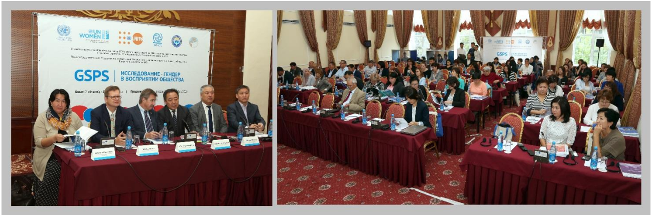
Final Conference on Results of GSPS

Strategy for Gender Equality, UN agencies' strategic plans and the programming priorities of civil society actors. Final conference on results of GSPS was conducted for a wide range of state and non-state stakeholders, marking also the closure of 18-months project in September 2016.