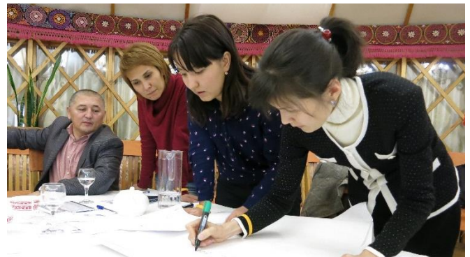
Training for field researchers on data collection