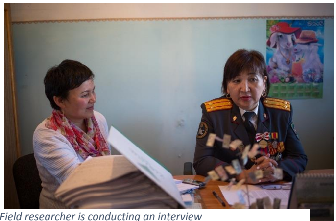
Field researcher is conducting an interview