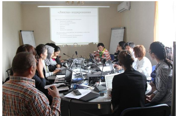
Training for field researchers on data coding and analysis, using MaxQDA analytical software programme

Based on the issues identified by the GSPS, workshops for relevant state and non-state actors on policy and programme formulation were conducted, with the aim of further informing future action. In addition, the GSPS findings will inform NAP 1325 recommendations, the 2016-2018 Implementation Plan for the National